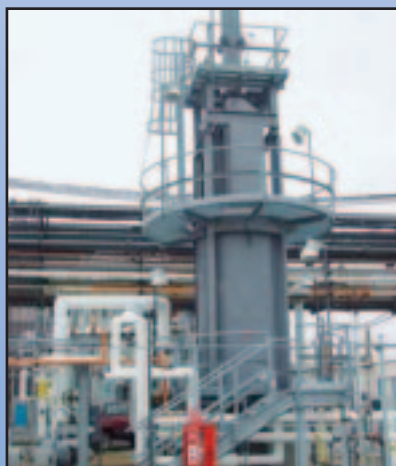
9836 Boiler 3.0 mm btu/hr struther wells therminol heater system, new 1998