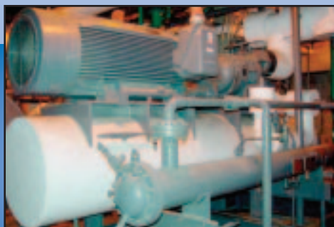
9821 Chiller 100 ton fes packaged refrigeration chiller, new 1998

The Specialty Chemical Complex is located in Niagara Falls, NY, USA. Arrangements to inspect the equipment can be made at your convenience.