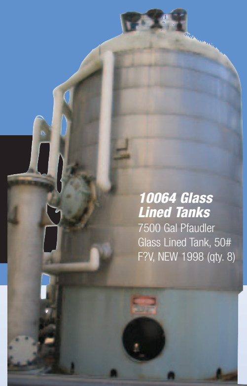
10064 Glass Lined Tanks 7500 Gal Pfaudler Glass Lined Tank, 50# F?V, NEW 1998 (qty. 8)

If you do not find what you are looking for here, please contact our sales team to see if we have it available from our global inventory.