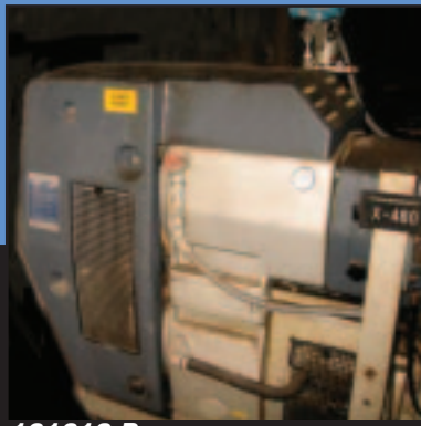
101016 Pump 444 CFM@0.3 Busch/Huckepuck vacuum pump system, mfg.