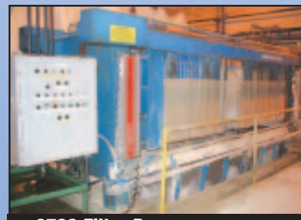
9722 Filter Press 40" x 40" durco polypropylene recessed plate filter press, 817 sq ft filter area