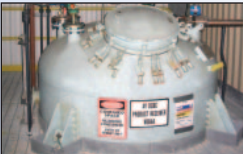
10028 Glass Lined Tank 2000 gal pfaudler glass lined tank, 50# f/v, new 1997 (qty. 5)