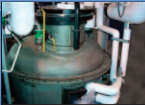
9764 Tank-Pressure 1000 Gal Vertical Monel 400 Pressure Tank, 100# F/V, BUILT 1998 (Qty. 3)