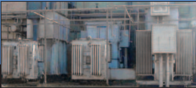
GE Rectifier Built 1996