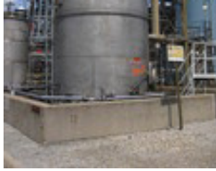
TANKS, Built: 1998. Previous usage: Xylene Storage Tank.