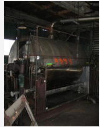
5' diameter x 7' Goslin Birmingham Chrome Plated Drum Flaker